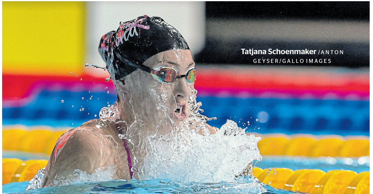
Tatjana Schoenmaker